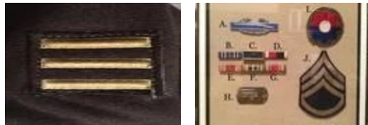
Photo 2 shows the Overseas Service Bars, which are displayed as an embroidered gold bar worn horizontally on the right sleeve of the Class A uniform and the Army Service Uniform. Overseas Service Bars are cumulative, in that each bar worn indicates another six-month period.

Lindsay Allee - April 29, 2017 at 03:24 PM